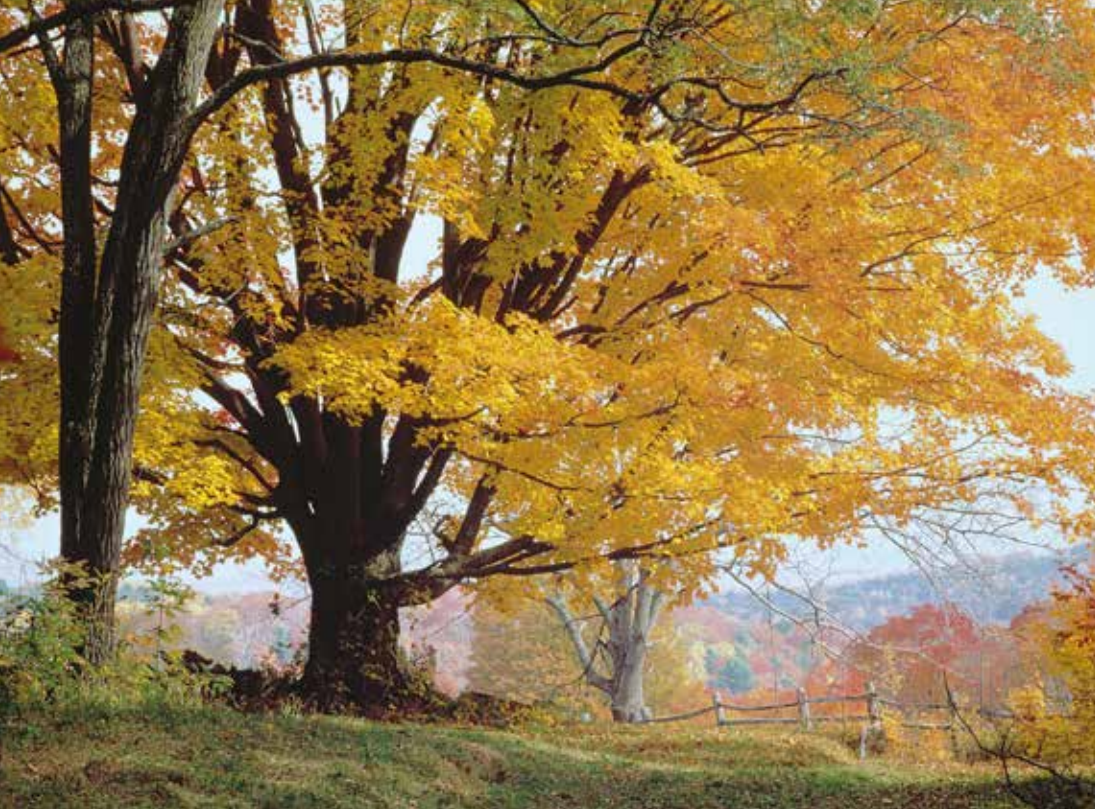
Maple, host tree to maple mistletoe ( Viscum album , Aceris )