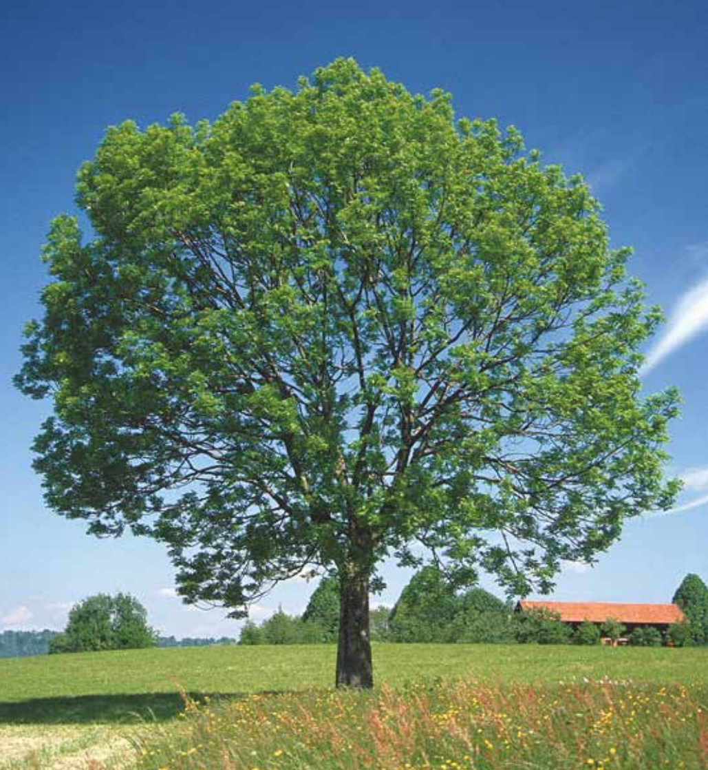
Ash, host tree to ash mistletoe ( Viscum album , Fraxini )