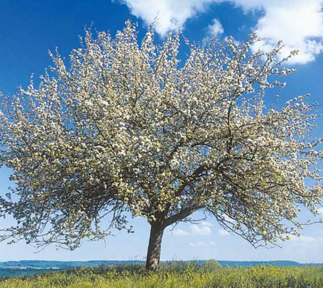
Apple tree, host to apple mistletoe ( Viscum album , Mali)

All healthy cells follow an ordered life course. The life cycle of malignant cells and their proliferation by cell division, however, no longer fits in with the body as a whole and develops an independent "life of its own". Scientifically, the cause of this lies in the presence, in the diseased cells, of "disrupted" genes which are responsible for cell growth and function. In healthy subjects, this genetically ordained programming is also controlled by the neighbouring cells and by messenger substances in the human blood so that human organs or tissues assume an appropriate size and form. Each organ grows or regenerates itself to its natural individual size and shape. The diseased cell, however, lacks "information" about its function and its intended location. It therefore invades foreign tissue as well and migrates,