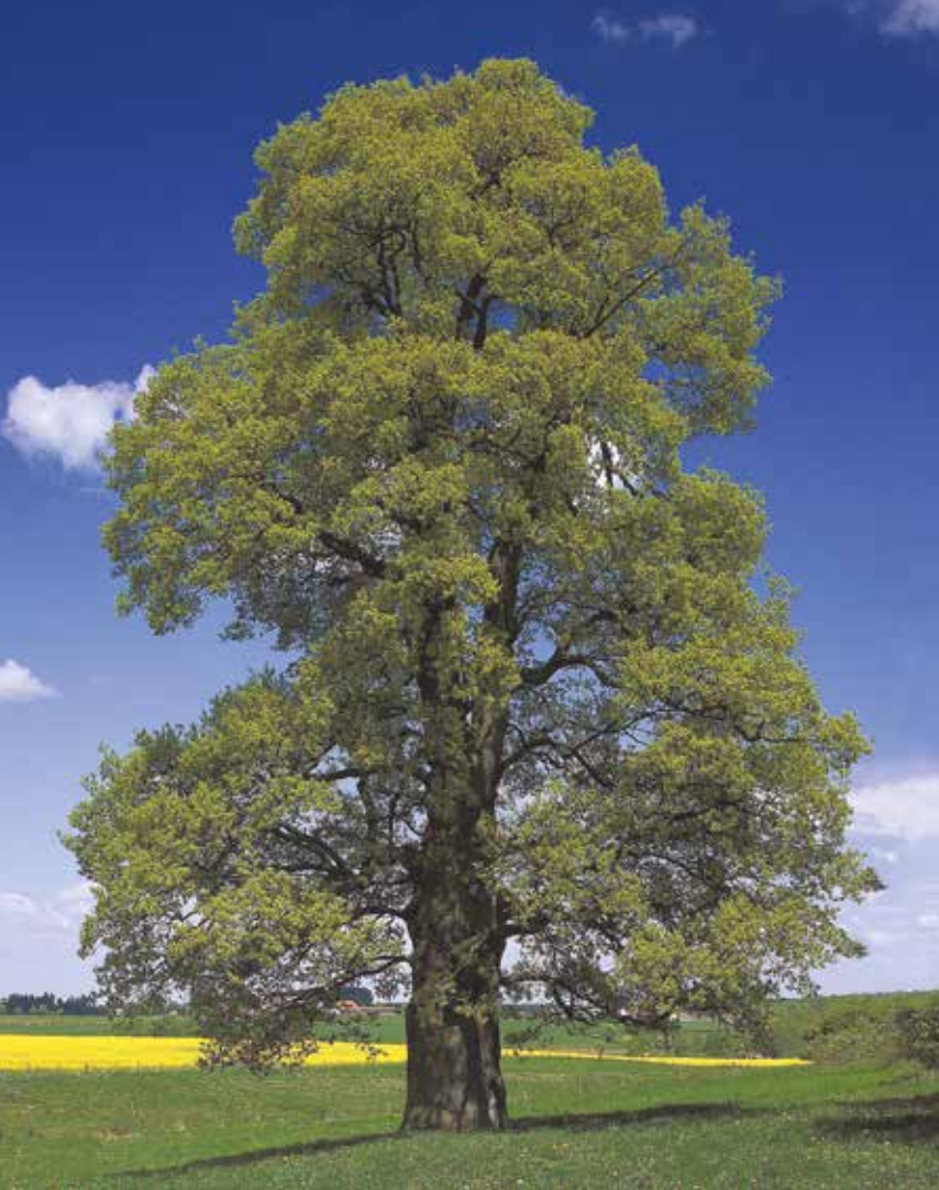
Oak, host tree to oak mistletoe ( Viscum album , Quercus )

and for practical questions about coping with the disease or about the situation of relatives, you will find the appropriate contacts mentioned below.