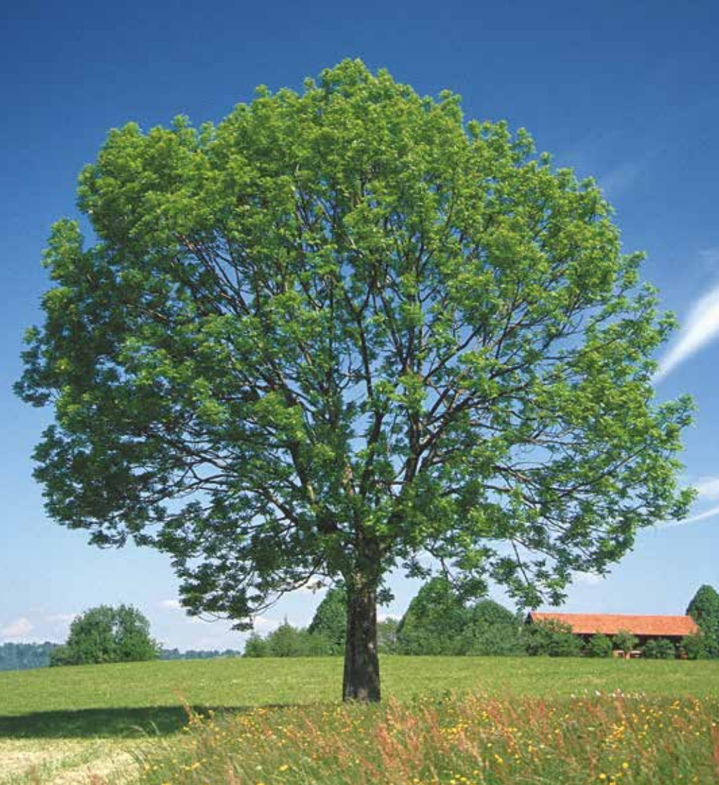
Ash, host tree to ash mistletoe ( Viscum album , Fraxini)

To begin with, your doctor or her/his assistant will show you how to use the ampoule and the syringe. During the therapy, you yourself or a member of your family can give the injection. Please note the following: At the beginning of treatment (for about 8 weeks) when stronger reactions are possible, the injections should be followed by half an hour's rest. Change the injection sites. As a rule, injections are given under the