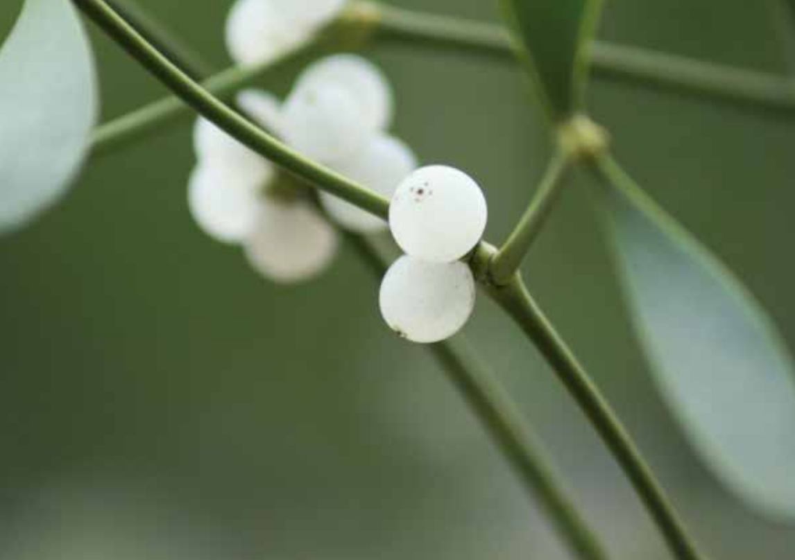
Mistletoe branch in winter