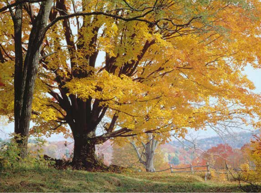
Maple, host tree to maple mistletoe ( Viscum album , Aceris )