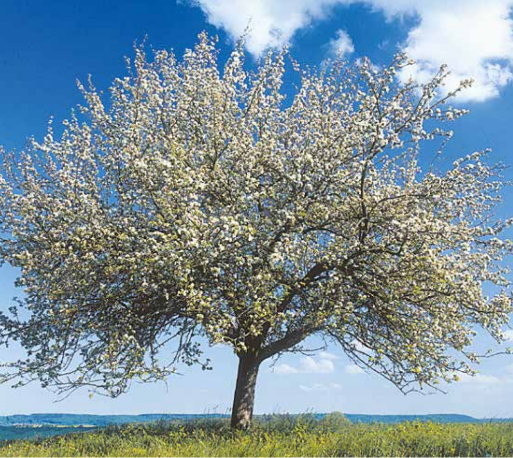
Apple tree, host to apple mistletoe ( Viscum album , Mali)

Historically, cancer has been detectable from the earliest times. However, the frequency and nature of the disease have changed with the different civilisations. Today, for example, tumour diseases of the bowel are increasing because of changes in dietary habits.