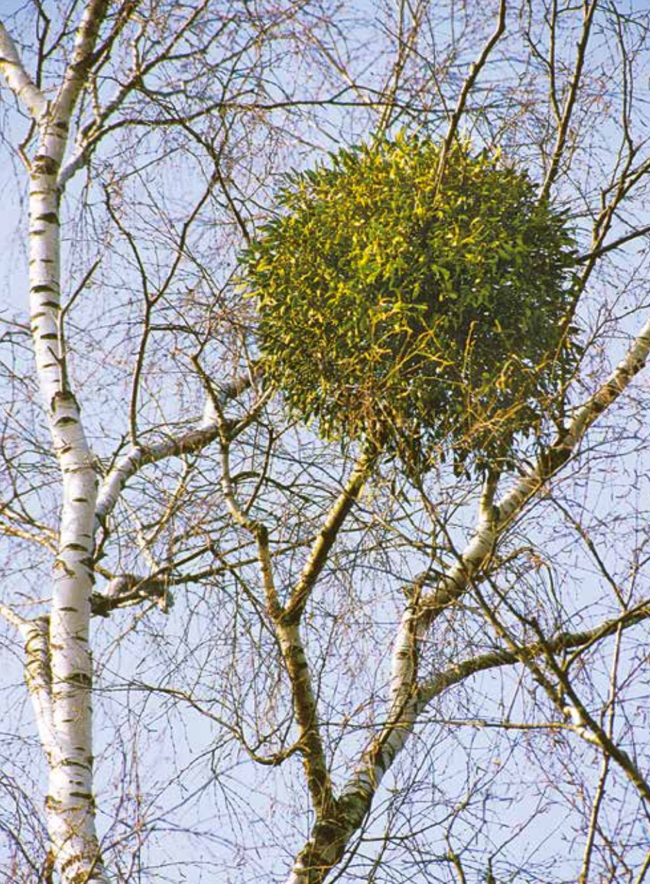
Mistletoe plant in winter, birch, host tree to birch mistletoe ( Viscum album , Betulae )

Mistletoe therapy can reduce or make more bearable the pain which can occur in advanced stages of tumours by stimulating the release of endorphins . Endorphins are natural morphines produced by the body which have a pain-relieving action.