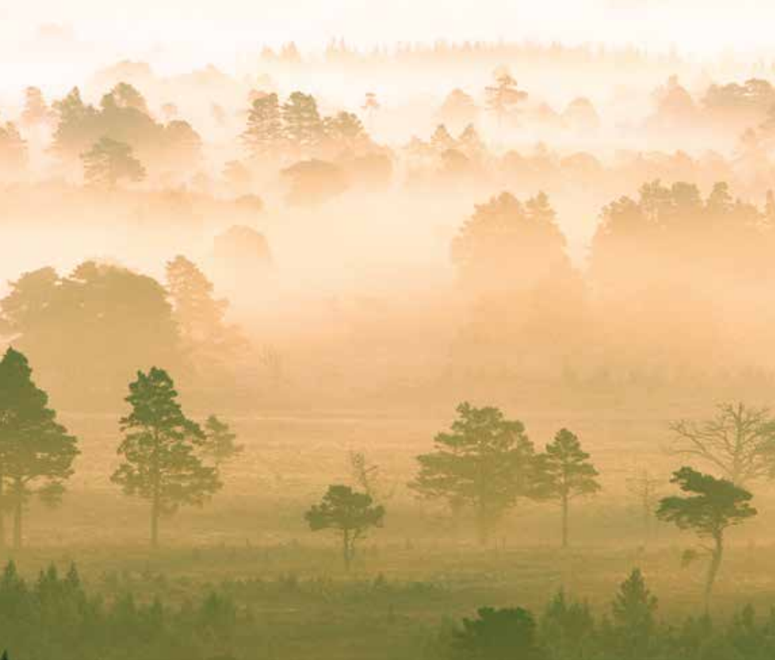
Pine, host tree to pine mistletoe ( Viscum album , Pini)

A further distinction is made between local therapies , which combat a tumour directly by surgery, radiotherapy or the targeted administration of drugs, and systemic therapies. Systemic therapies have a cytostatic or hormonal effect and suppress the growth of diseased cells and tissue in the whole body or, as mistletoe therapy does, stimulate the immune system in its role against the cancer.